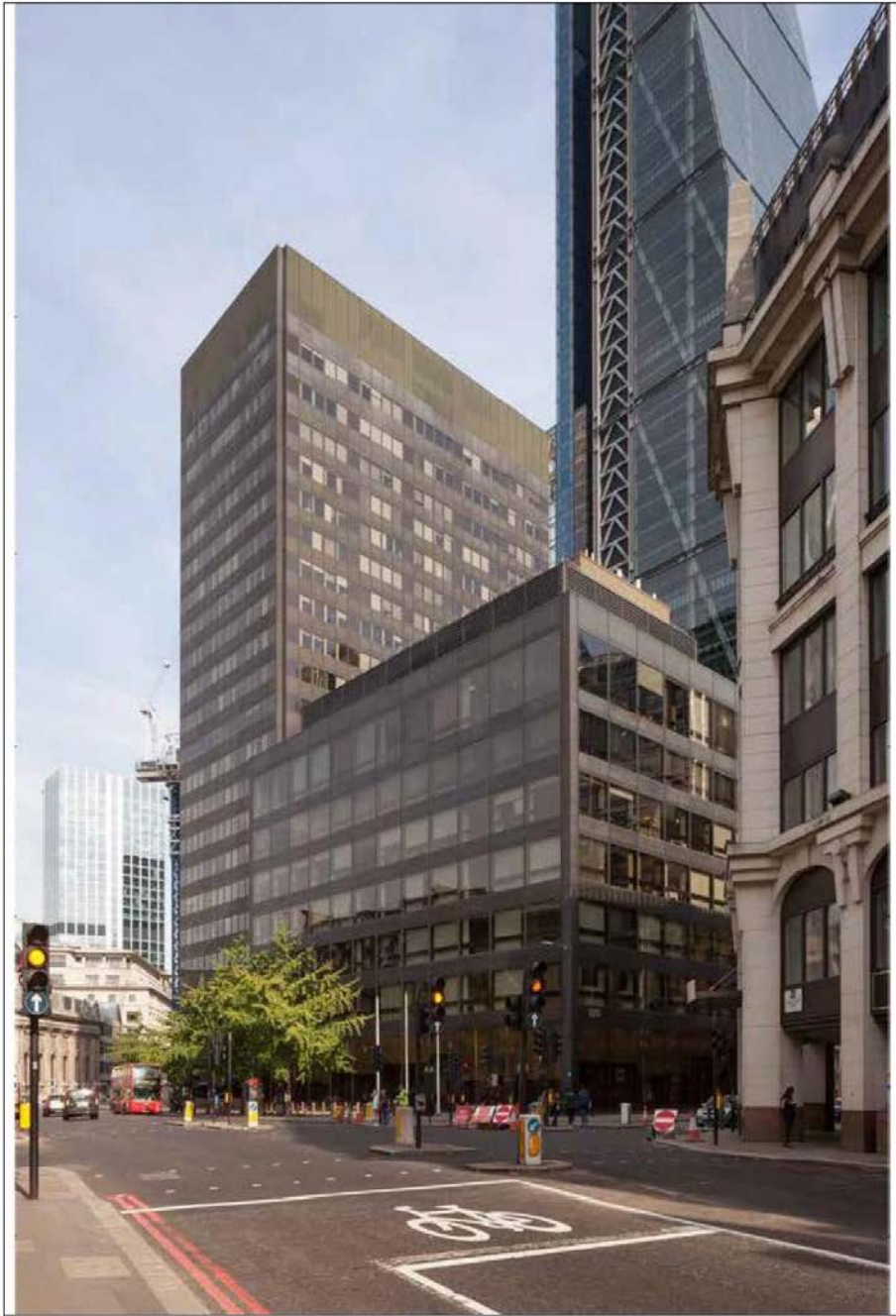
1. View north from Gracechurch Street