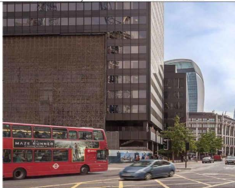
3. View south from the junction of Bishopsgate and Threadneedle Street