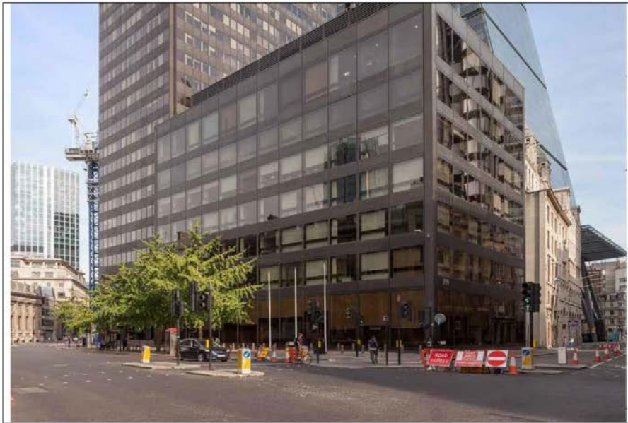
2. View north east from the junction of Gracechurch Street and Cornhill